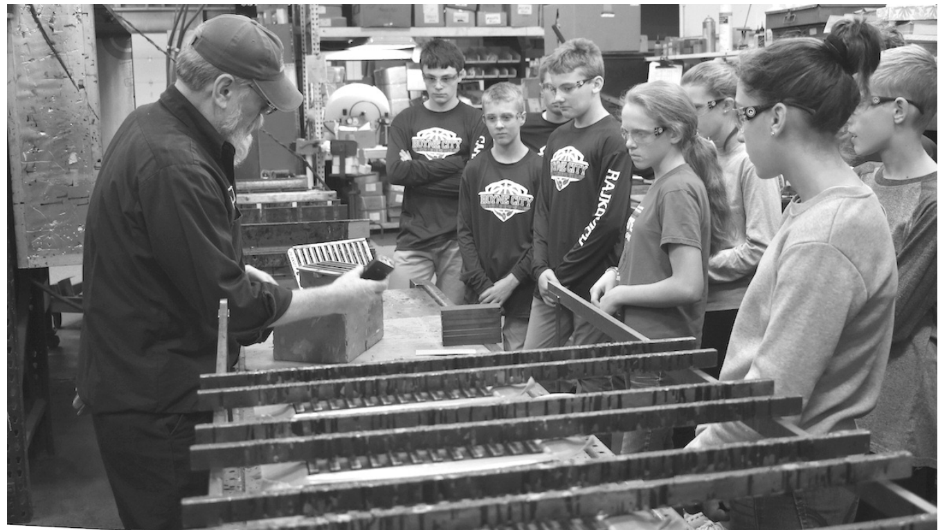
Char-Em Intermediate School District juniors and seniors will have the opportunity to tour some of the region's most unique and important manufacturing facilities Oct. 8-10, as National Manufacturing Day returns to Northern Michigan.

Char-Em Intermediate School District juniors and seniors will have the opportunity to tour some of the region's most unique and important manufacturing facilities Oct. 8-10, as National Manufacturing Day returns to Northern Michigan. Tours will take place during the school day at numerous plants in Charlevoix, Emmet and Antrim counties, as well as a few in Cheboygan and Presque Isle counties near to the ISD's northern districts.