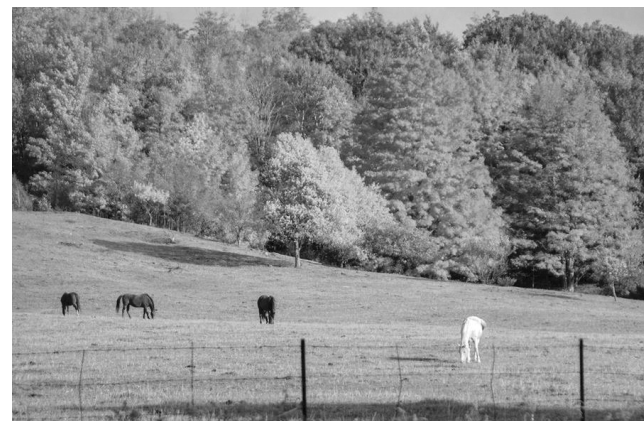
The 11th Annual Autumn on the Breezeway Color Cruises will be held on three Saturdays, September 28, October 5 and October 12.