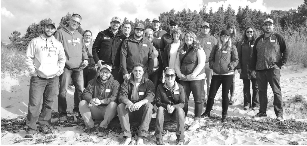
Leadership Charlevoix County is excited to announce its newest class for 2019-2020.

The 19 member class started with an orientation meeting and mentor networking session at Boyne Mountain Resort. Their first class session was a two-day overnight retreat on Beaver Island September 8-9. The class will now meet for class one day a month until graduation in May 2020. Class top-