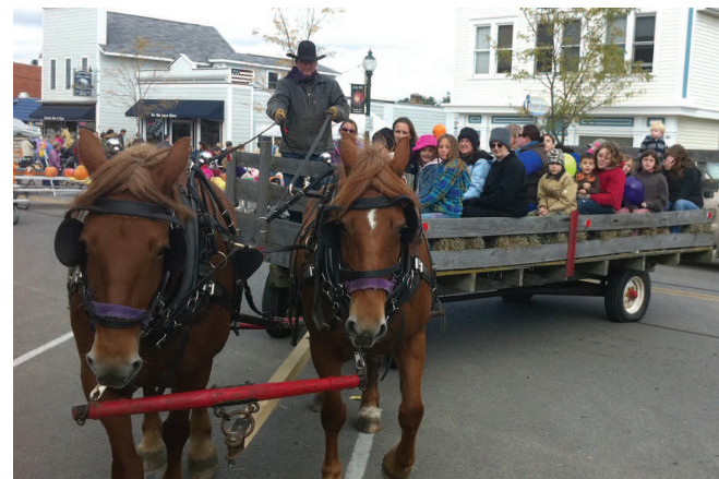
Hop on board a hay ride to enjoy the sights of Harvest Festival. File photo