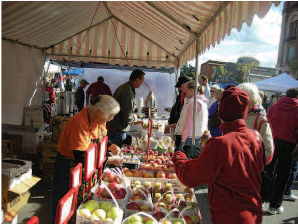
The Harvest Festival will include a farmers market, children's games, craft vendors and a scarecrow-making contest for residents and businesses. File photo