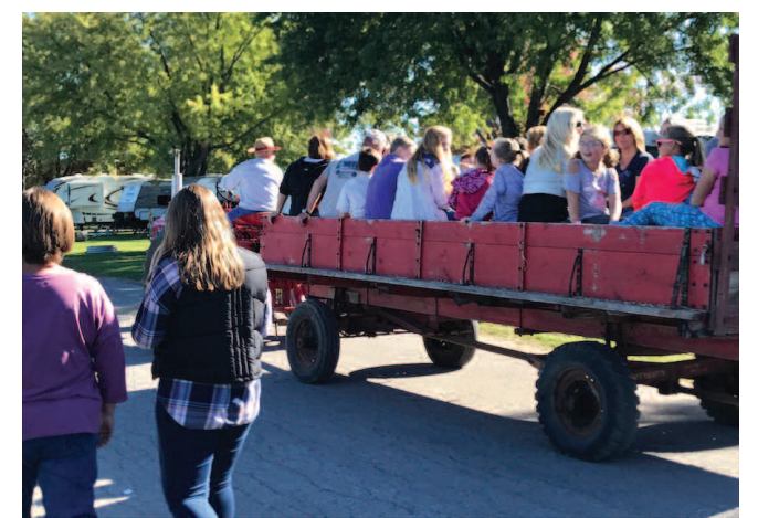
The City of East Jordan will present the 5th annual Fall Festival from noon until 10pm this coming Saturday, September 28.

The City of East Jordan will present the 5th annual Fall Festival kicking off with live music on Friday evening, September 27, and continuing from 9am until 10pm on Saturday, September 28. Taking place in Tourist Park, in addition to live music and a beer tent, the festival will feature kids activities, a farmers market, craft show, a softball tournament, campsite decorating